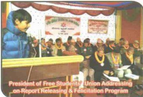
President of Free Students' Union Addressing on Report Releasing & Felicitation Program