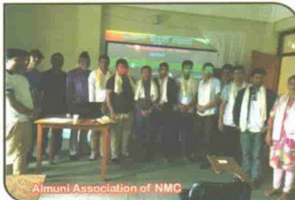
Alumni Association of NMC