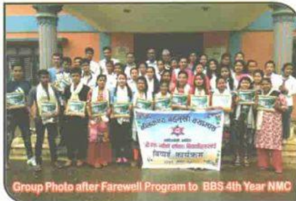
Group Photo after Farewell Program to BBS 4th Year NMC