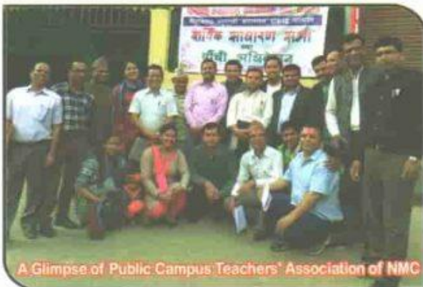
A Glimpse of Public Campus Teachers' Association of NMC