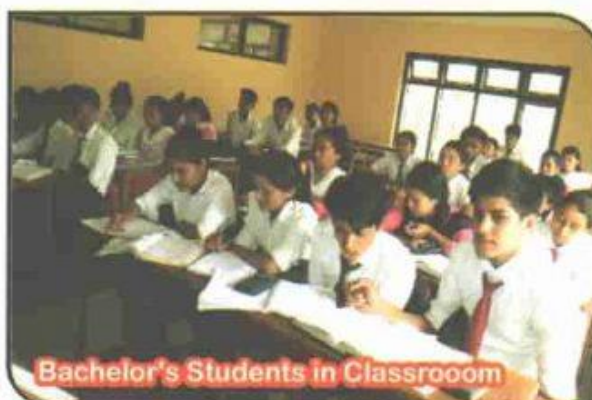
Bachelor's Students in Classroom