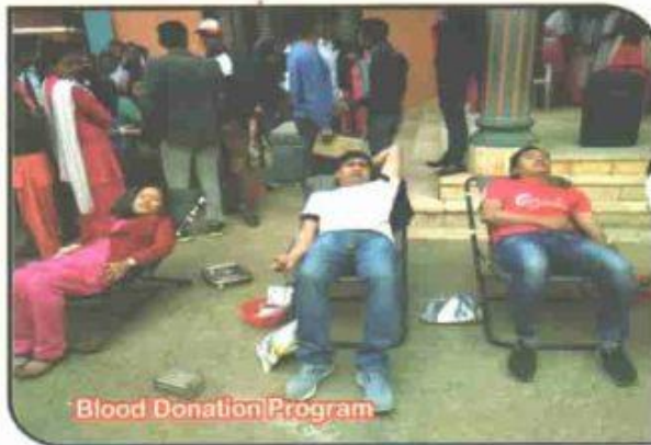
Blood Donation Program