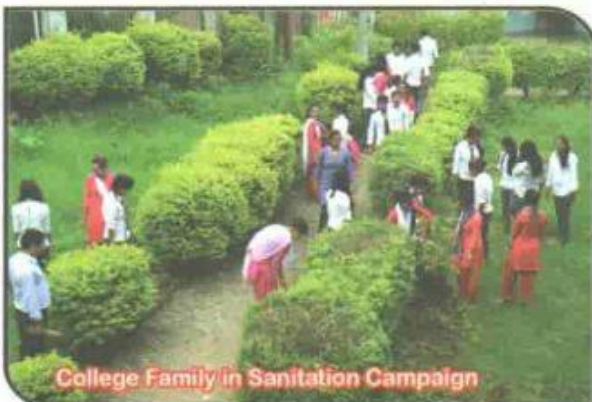
College Family in Sanitation Campaign