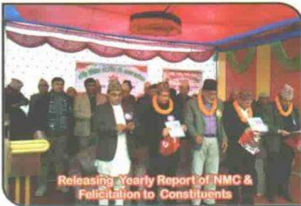
Releasing Yearly Report of NMC & Felicitation to Constituents