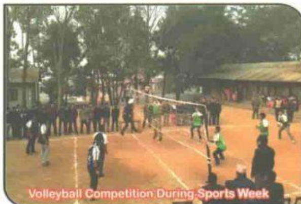
Volleyball Competition During Sports Week