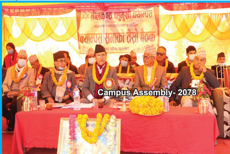
Campus Assembly- 2078