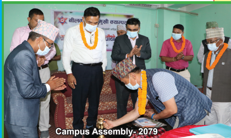
Campus Assembly- 2079