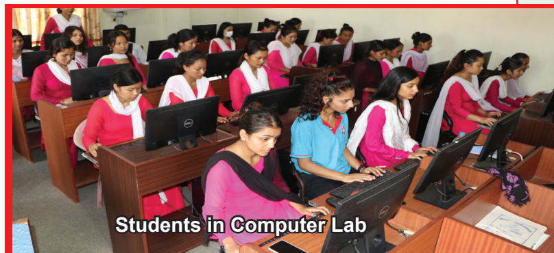
Students in Computer Lab