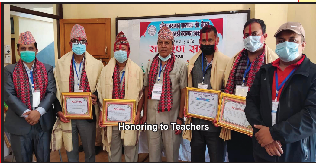
Honoring to Teachers