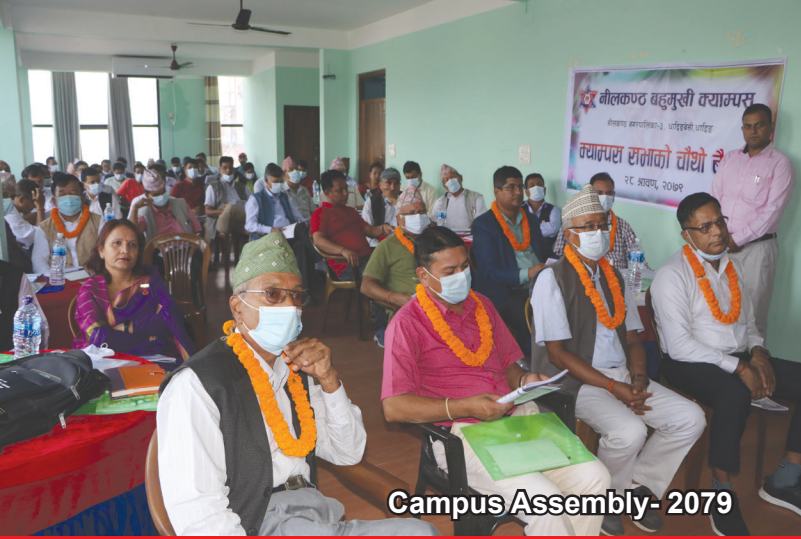
Campus Assembly- 2079