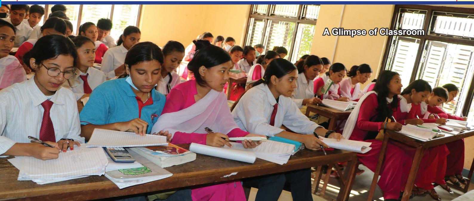
A Glimpse of Classroom