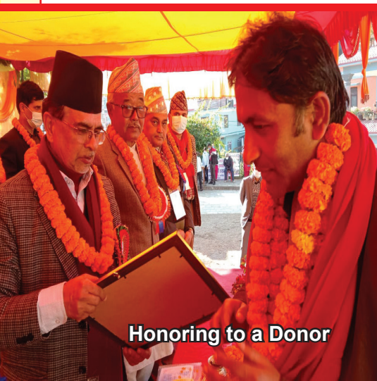
Honoring to a Donor