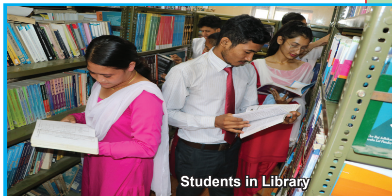
Students in Library